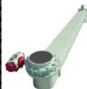
Standard Air Slides

We have parts for ROSS tilt mixers: pinion gears, cylinders, cylinder pins, pivot pins, valves, paddles, and much more.