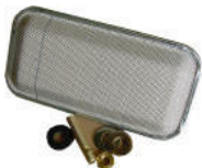
Air Pads & Mounting Kits

AERATION PAD WITH BRASS STUD, NUT AND WASHERS