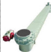
Standard Air Slides

We have parts for ROSS tilt mixers: pinion gears, cylinders, cylinder pins, pivot pins, valves, paddles, and much more.