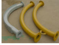
Air Loader Pipe Elbow