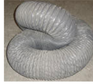
Hose and Clamps