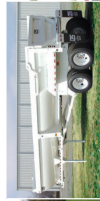
Quarter frame, Full frame available