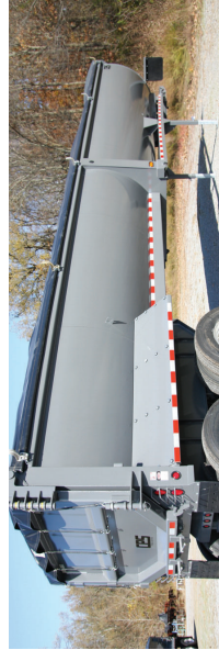
Factory Installed Tarps & Tailgate Options