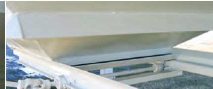
30" x 30" hopper doors