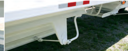
Fold down crank handles

Also available: Additional side heights (72", 78") Additional lengths A variety of tarp colors Stripe