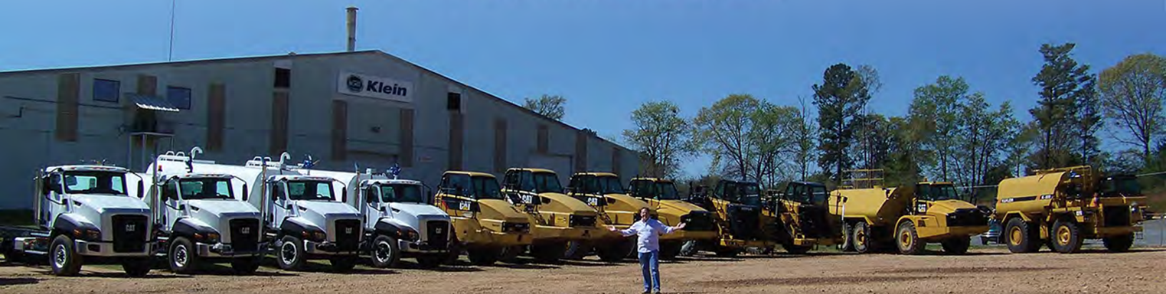
Klein Factory: 150,000 total Sq. ft. under roof. | 30 Acres – state of the art tank manufacturing facility.