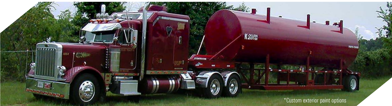
*Custom exterior paint options

kleinproducts.com | CA: 909-460-4546 | sales@kleinproducts.com Exports: + 1-972-479-0333 | exportsales@kleinproducts.com