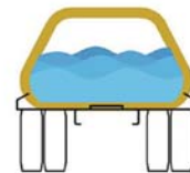
A KLEIN PATENTED, INNOVATION EARLY 2000'S TO CURRENT